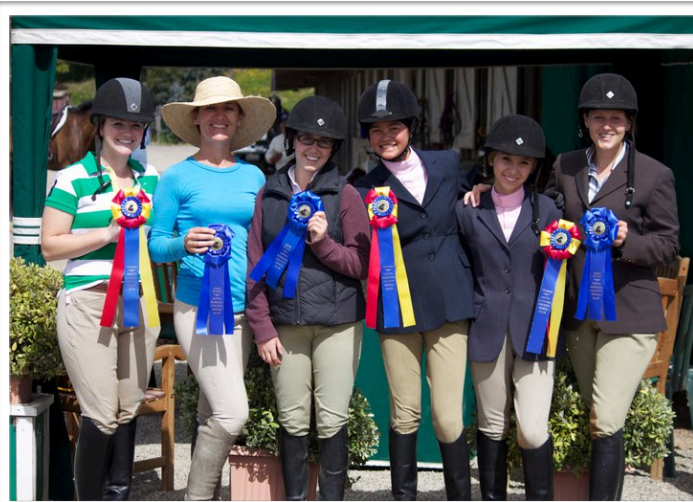
The gang from Santa Barbara Stables!